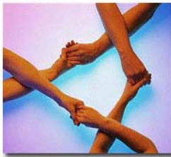
Sherlock Asset Finance

Sherlock Asset Finance, holding your hand through the finance process!